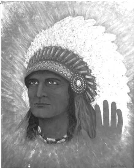
White Wing Spirit Guide